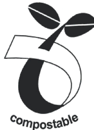
Fig. 3 EN13432 compliant compostability label

Considering the variation in waste management infrastructure, impact assessments of bioplastics on infrastructure should be at a national and maybe regional